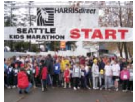
Last year, tens of thousands of runners of all ages participated in the Harrisdirect Seattle Marathon, which raised US$40,000 to assist children living with cancer.

For the second year in a row, Harrisdirect sponsored the Harrisdirect Seattle Marathon . A tradition in the Seattle, Washington area for 35 years, the race attracts thousands of athletes and tens of thousands of cheering fans. Ranked by Runner's World magazine as one of the top 20 marathons in the United States, and an economic boon to the city of