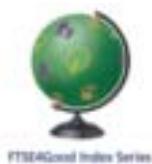
FTSE4Good Index Series

Detailed information about our other environmental practices can be found on our web site at www.bmo.com/community .