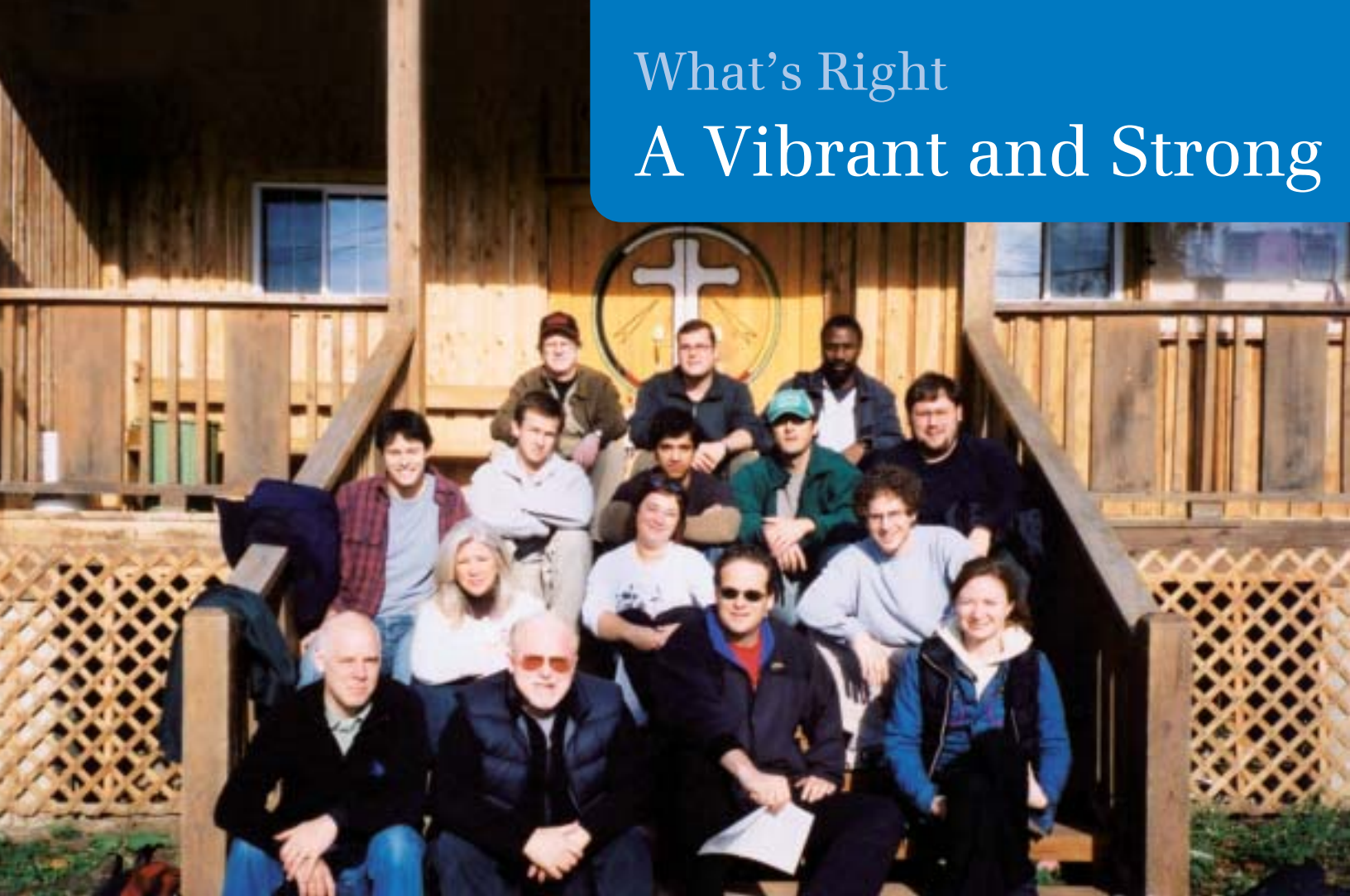
A troupe of artists from Toronto's Soulpepper Theatre Company shares experiences and talents with members of the De-ba-jeh-mu-jig Theatre Group, based in the Wikwemikong Unceded Indian Reserve on Manitoulin Island. This is one of the many community arts programs BMO supports.