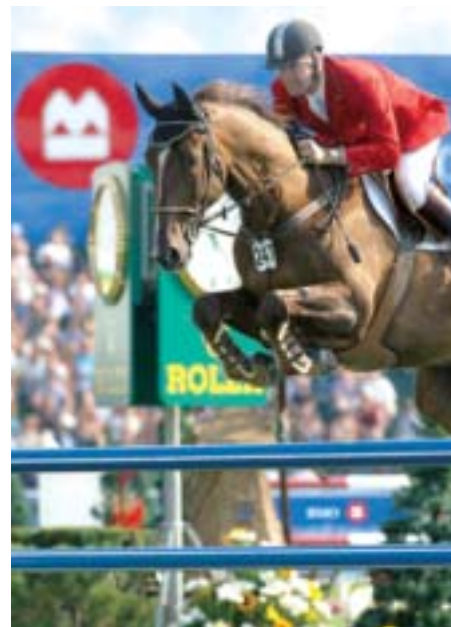
"Spruce Meadows is an extraordinary Camelot for our sport," says Ian Millar, veteran of the Canadian Show Jumping Team.

BMO is the founding sponsor of Spruce Meadows ®5 , one of the world's best equestrian facilities. Located near Calgary in the foothills of the Rocky Mountains, Spruce Meadows attracts hundreds of thousands of fans each year who come to